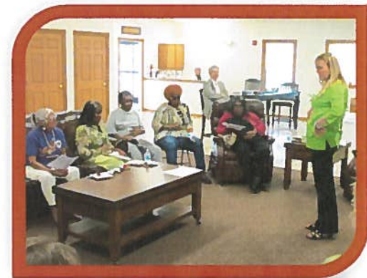
Pennwood Place residents participate in a Health and Wellness class.